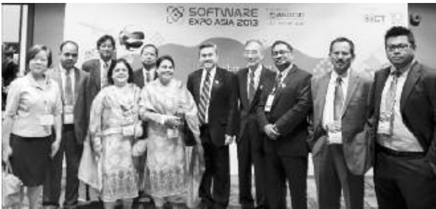
Delegates of ASOCIO ICT SUMMIT 2013

The next day, ASOCIO General Assembly and Board meeting took place. ASOCIO board members discussed about the present situation of the organization ▶