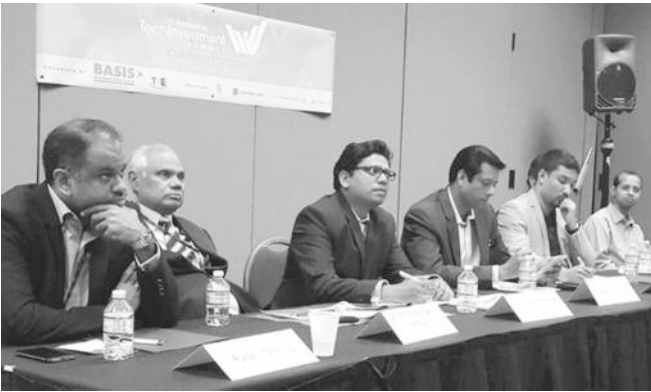
Sajeeb A Wazed, ICT Advisor to Prime Minister Sheikh Hasina is seen to deliver his keynote speech at the summit.

US Bangladesh Tech Investment Summit 2014 was a high level leadership meets where senior policy makers, technology entrepreneurs and industry leaders of Bangladesh met with the potential investors and business partners in USA. The objective of this event was to brand Bangladesh as the next Global IT destination, network with US entrepreneurs &